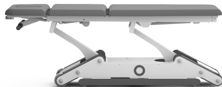
PRODUCT DIMENSIONS (cm)